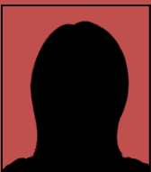
TBA Student Money Adviser