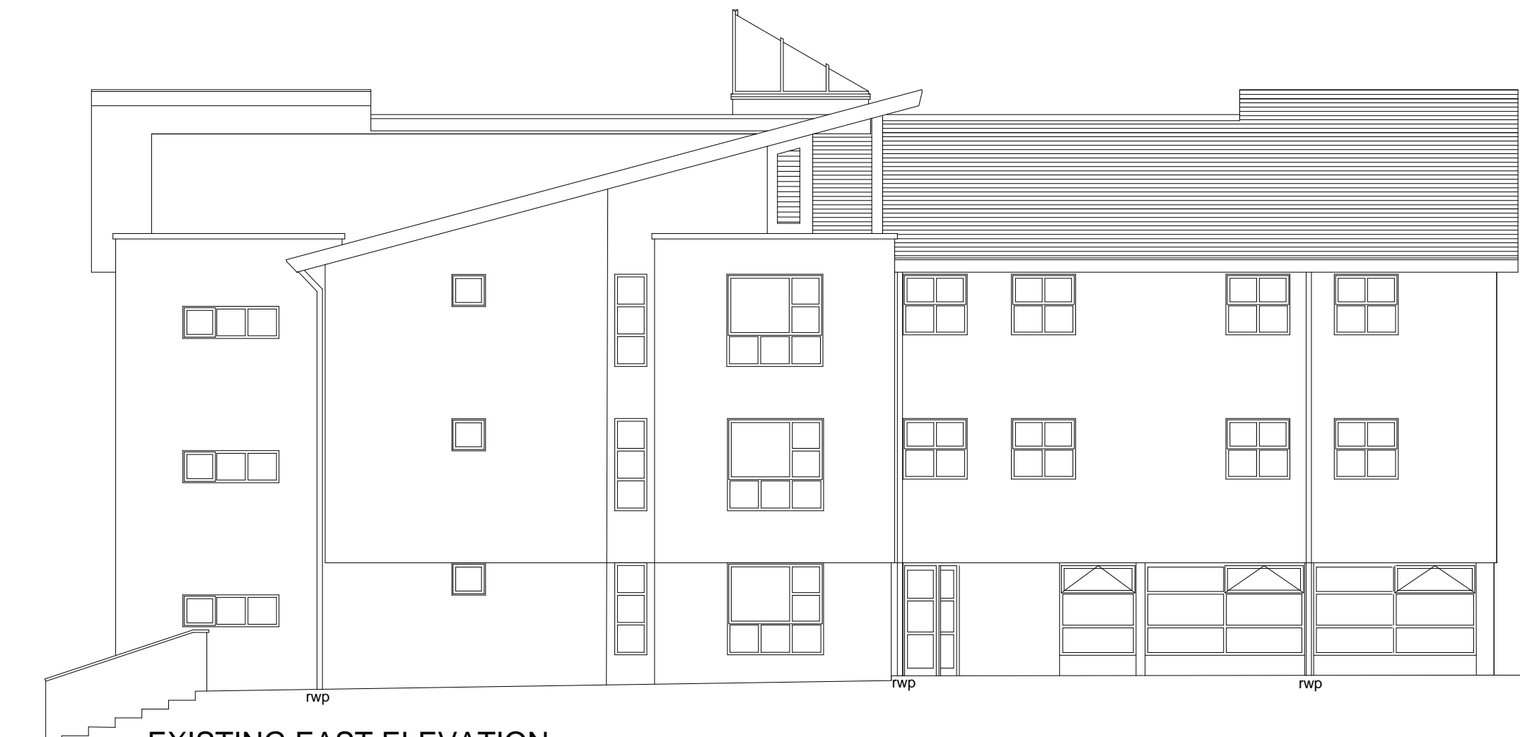
EXISTING EAST ELEVATION BLOCK 'A'