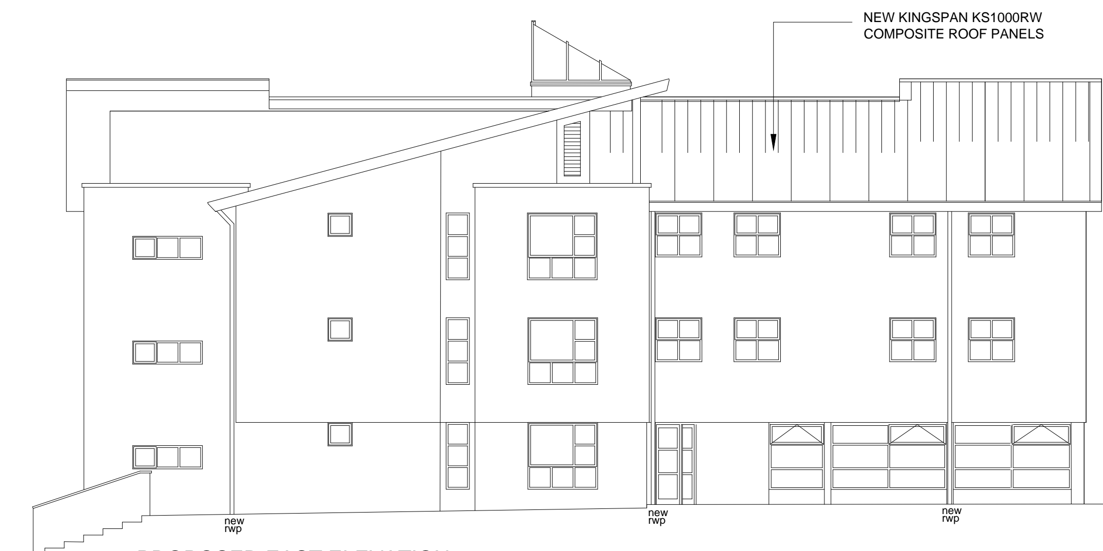
PROPOSED EAST ELEVATION BLOCK 'A'