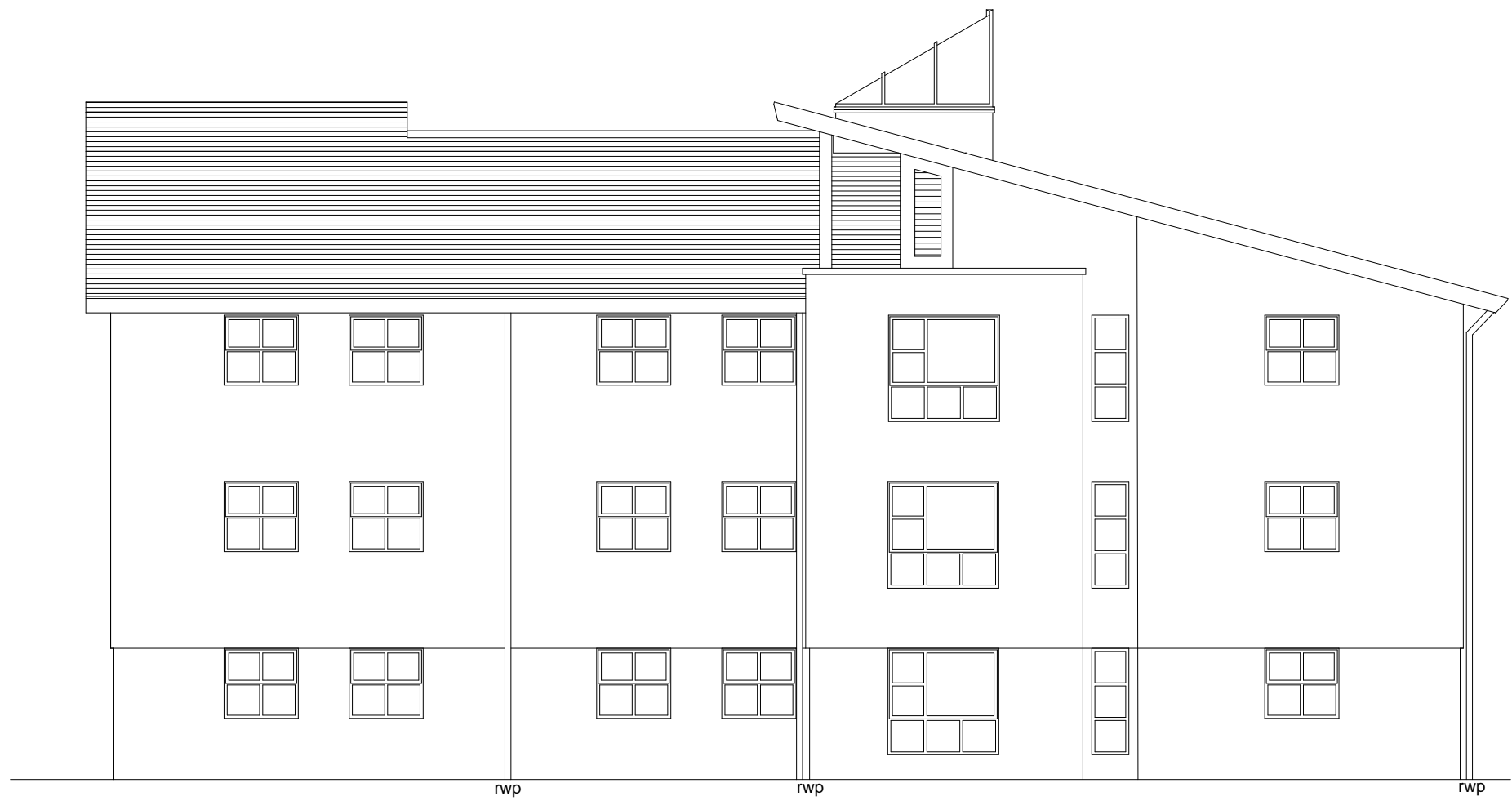
EXISTING NORTH ELEVATION BLOCK 'C'

NOTE! This drawing is copyright - NO unauthorised copying permitted - all dimensions shown are to be checked on site - do not scale from this drawing.