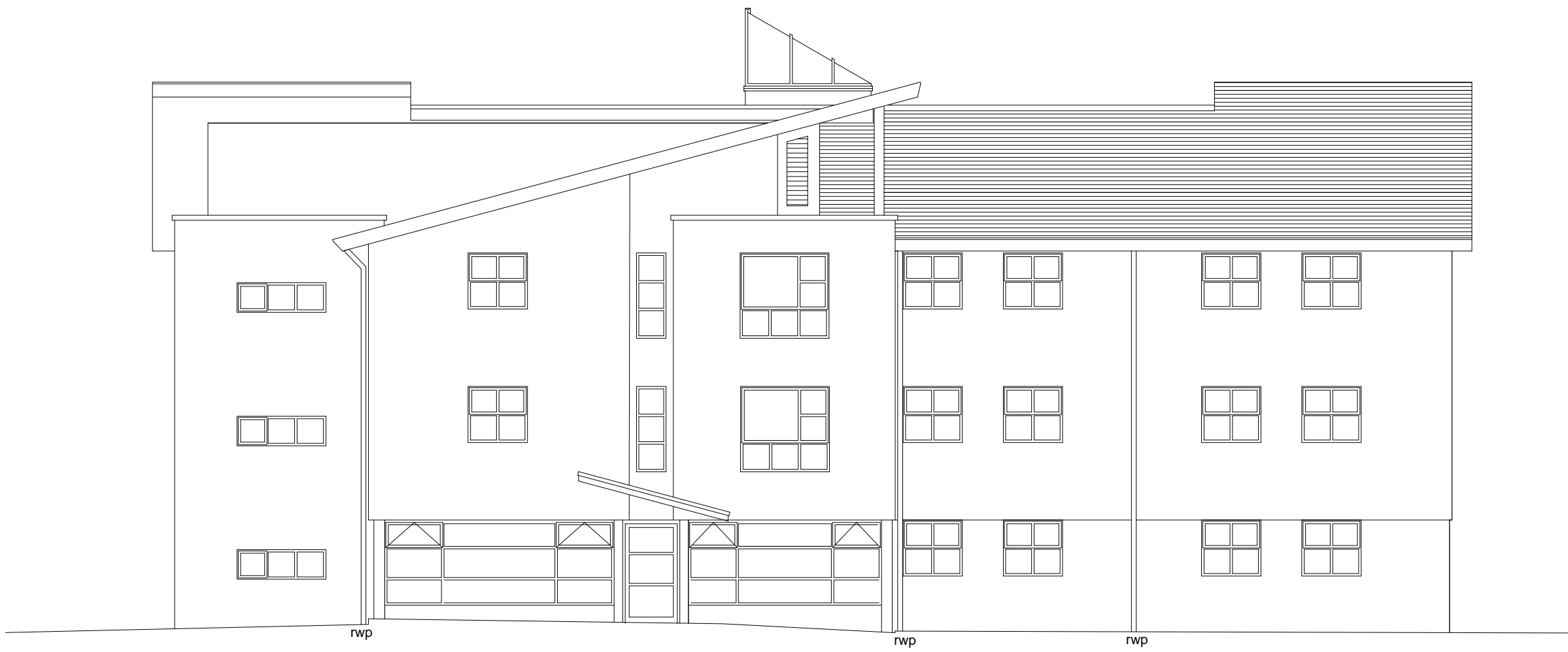
EXISTING NORTH ELEVATION BLOCK 'A'

NOTE! This drawing is copyright - NO unauthorised copying permitted - all dimensions shown are to be checked on site - do not scale from this drawing.