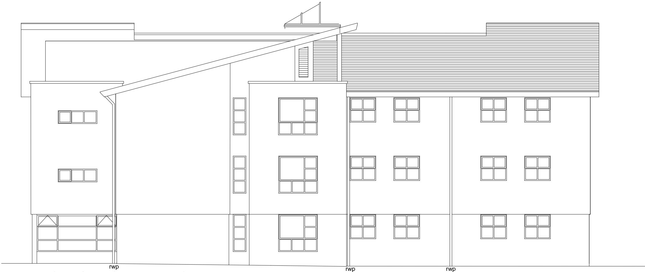
EXISTING WEST ELEVATION BLOCK 'A'