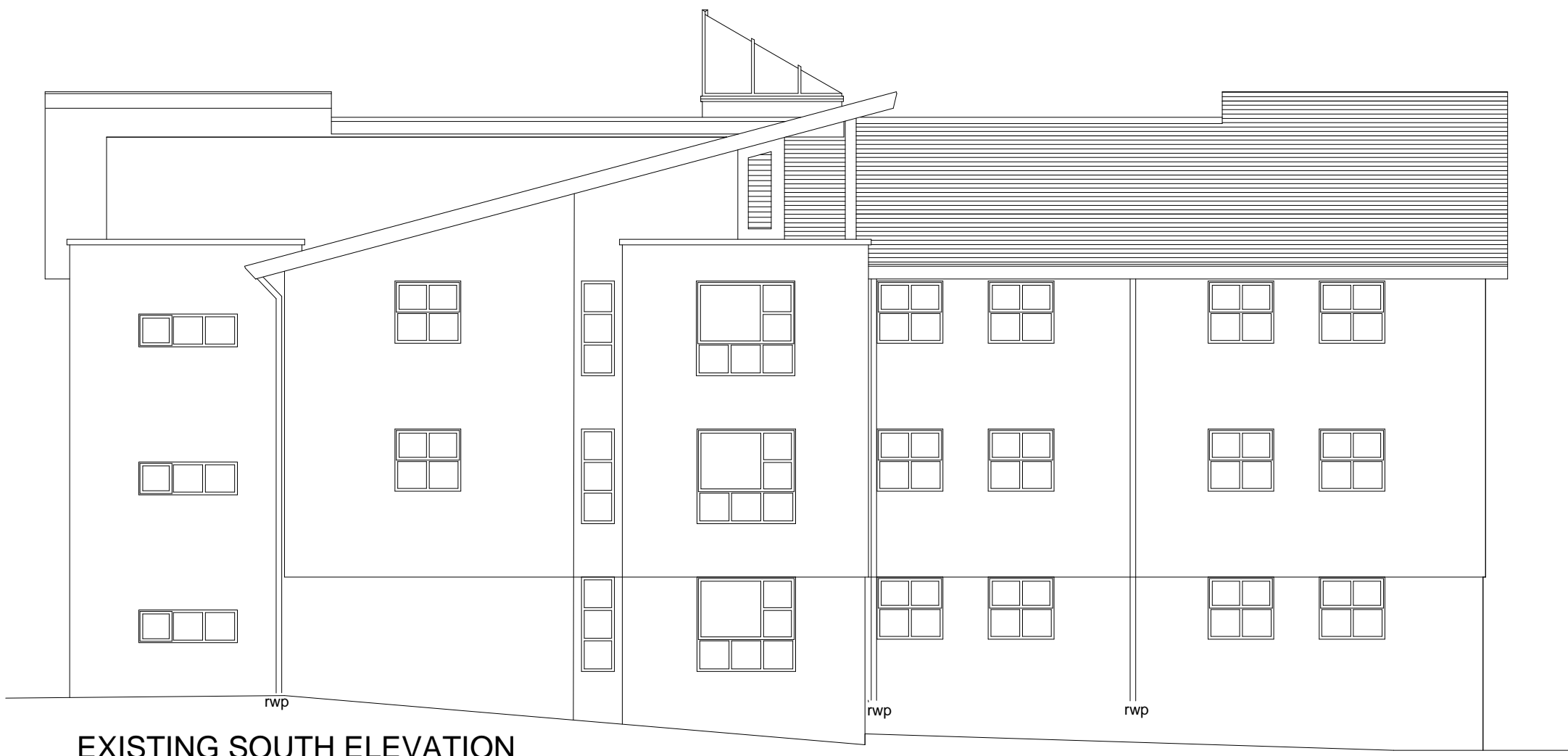
EXISTING SOUTH ELEVATION BLOCK 'A'