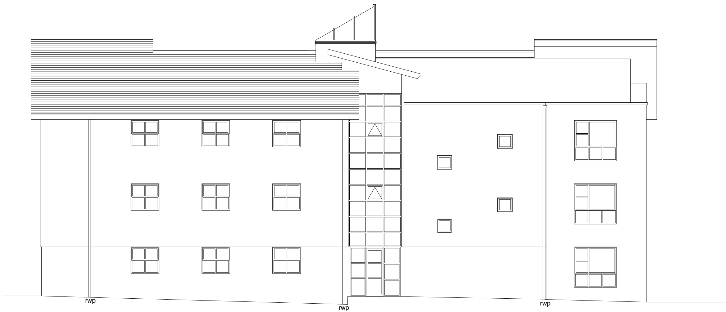
EXISTING WEST ELEVATION BLOCK 'C'