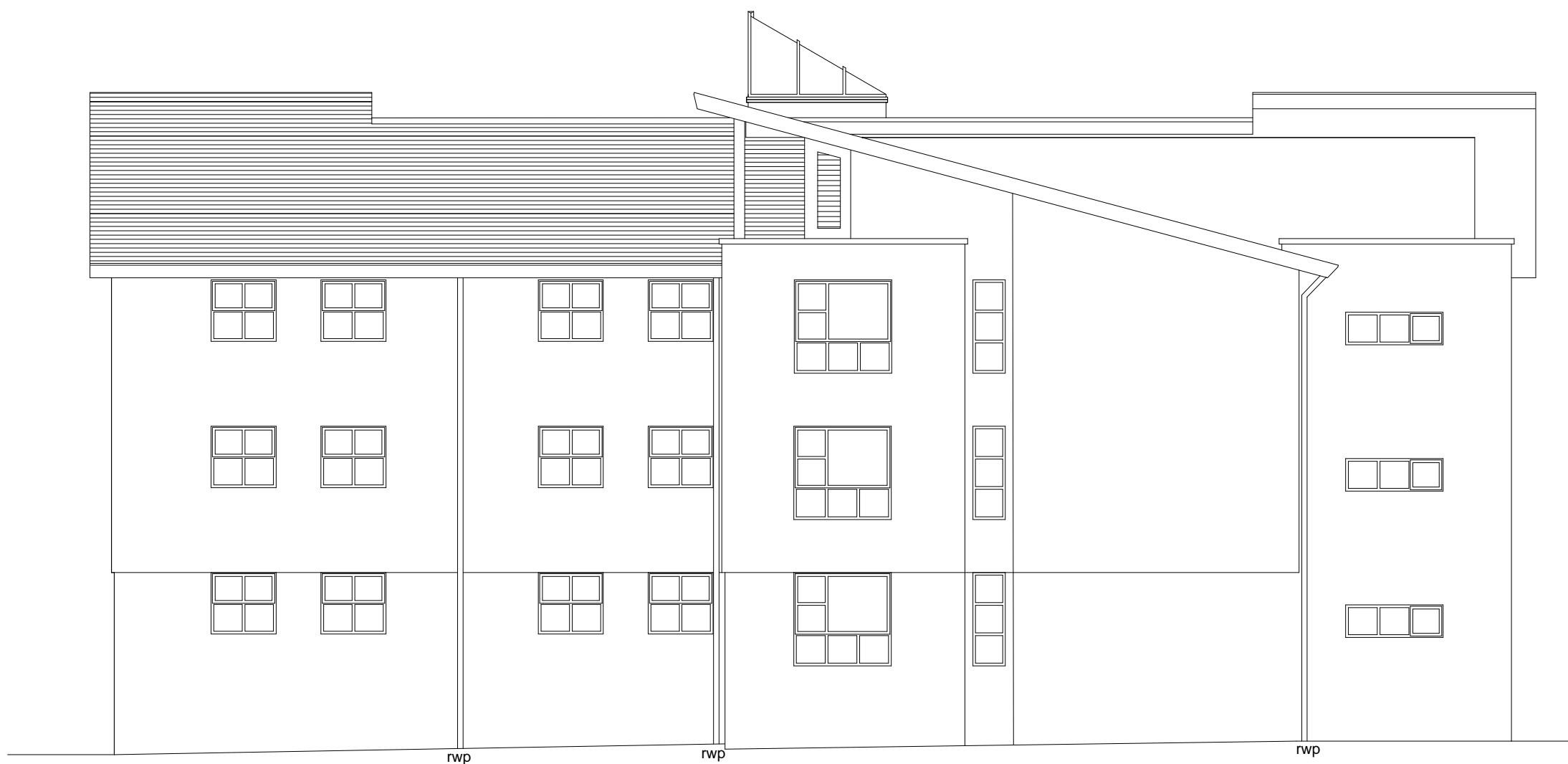
EXISTING EAST ELEVATION BLOCK 'C'