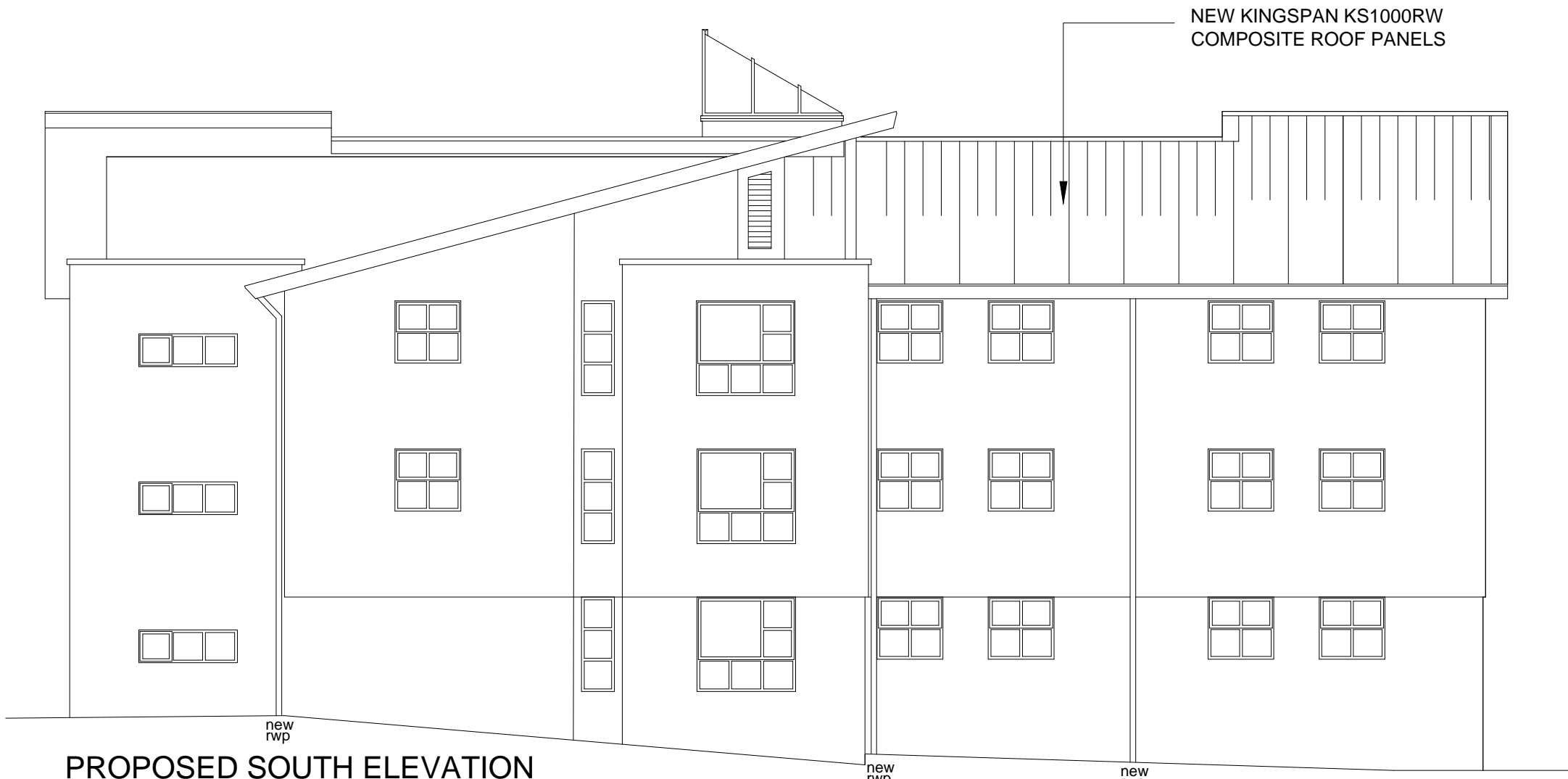
PROPOSED SOUTH ELEVATION BLOCK 'A'