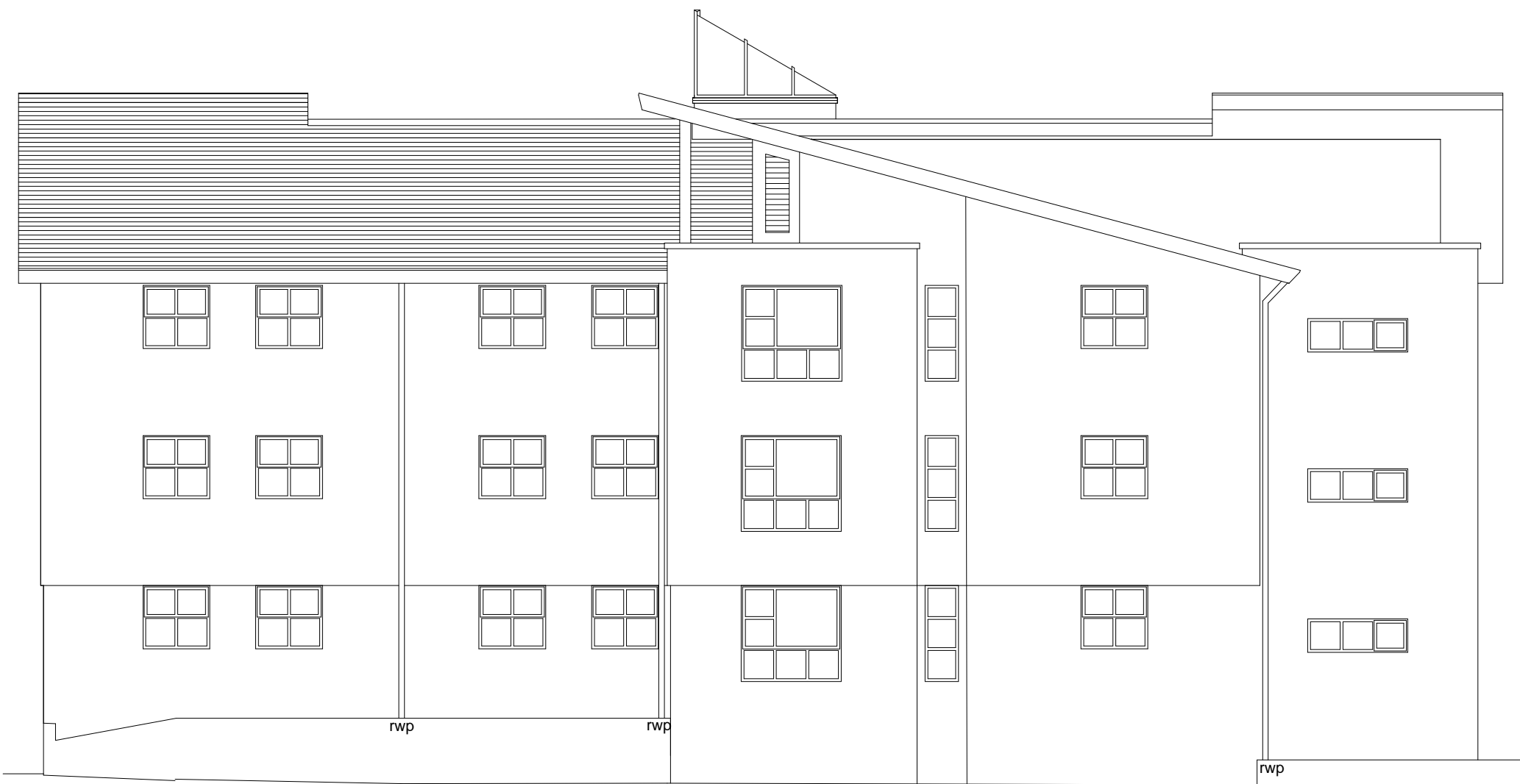
EXISTING SOUTH ELEVATION BLOCK 'B'