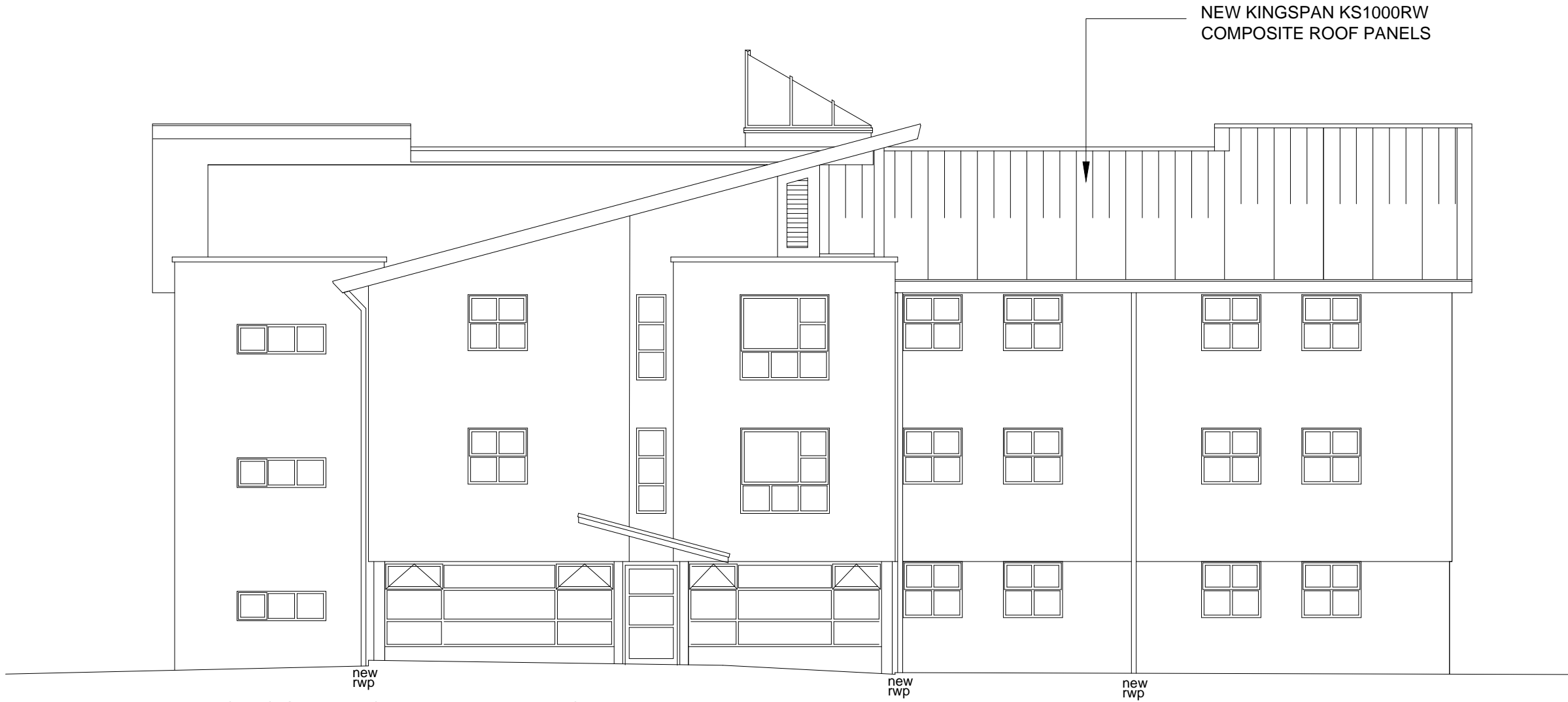
PROPOSED NORTH ELEVATION BLOCK 'A'

NOTE! This drawing is copyright - NO unauthorised copying permitted - all dimensions shown are to be checked on site - do not scale from this drawing.