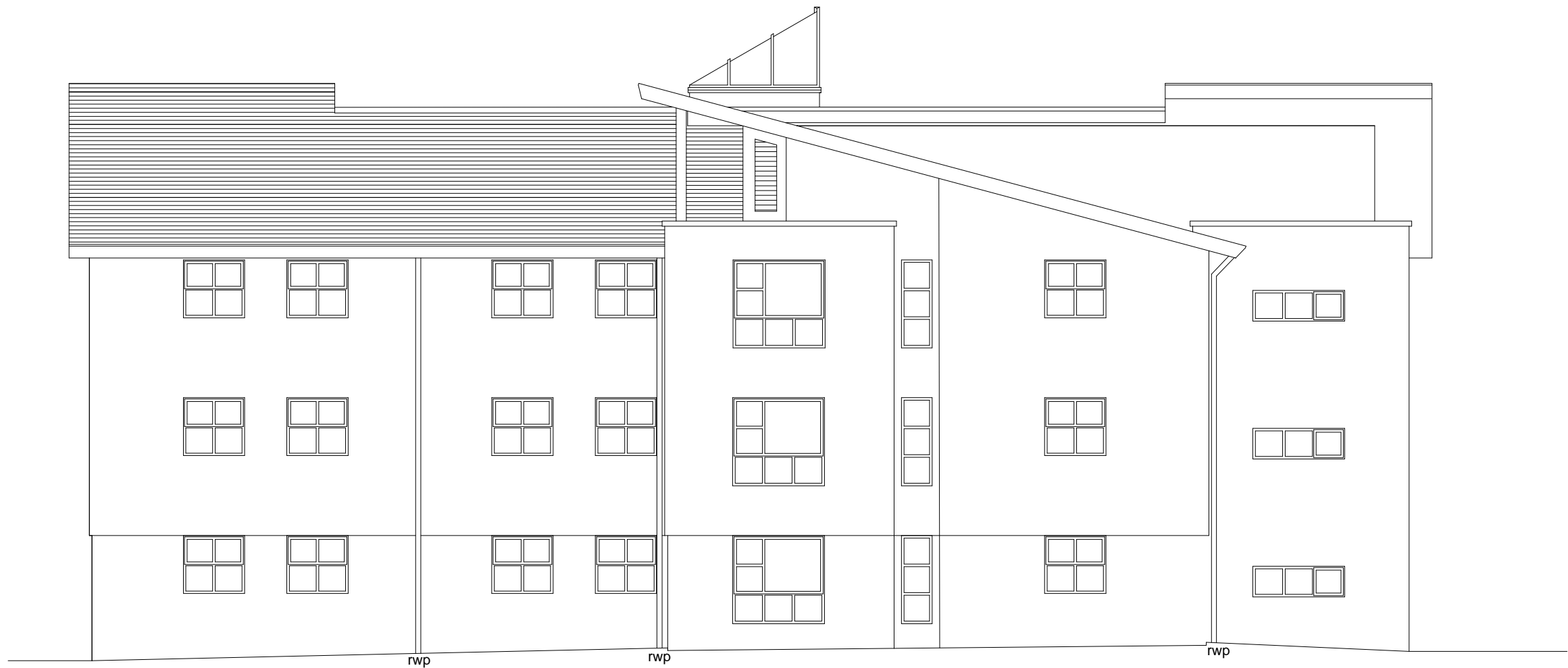
EXISTING NORTH ELEVATION BLOCK 'B'

NOTE! This drawing is copyright - NO unauthorised copying permitted - all dimensions shown are to be checked on site - do not scale from this drawing.